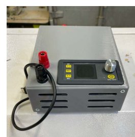
Final product design