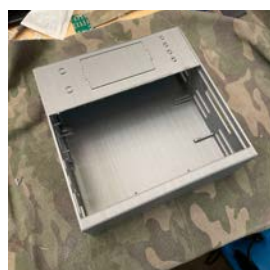
3D printed study

Past Lives process is managed to ensure the final design meets the use and performance criteria.